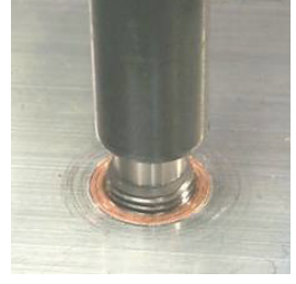
Use wrench provided.